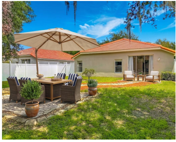
11438 Arborside Bend Way, Windermere, FL 34786